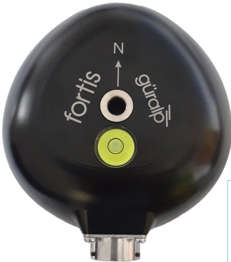
FORTIS AT ACTUAL SIZE (125 MM DIAMETER)

The Güralp Fortis is a strong motion analogue accelerometer with an innovative, slim-line design for fast installation in any environment.