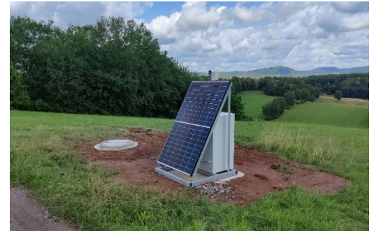
Figure 4 One of the completed array stations