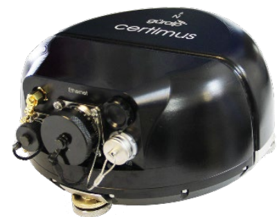
Figure 5 Certimus

With a wide frequency response of 120 s - 100 Hz, the low-power Certimus also benefits from a remotely adjustable long-period corner. The 1 and 10 second modes can be adjusted pre- or post-deployment and significantly reduce the settling time of the sensor.