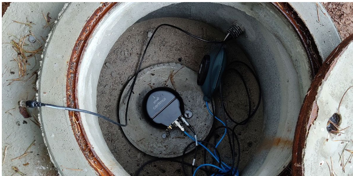
Figure 1 Installation of a Certimus seismic station forming part of the array.